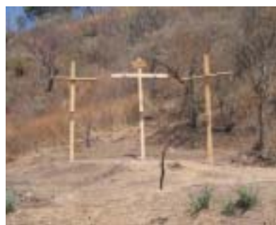
Holy Week Rituals in Mexico ~4~