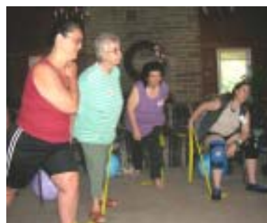
The Joy of Engaging in Justice ~16~