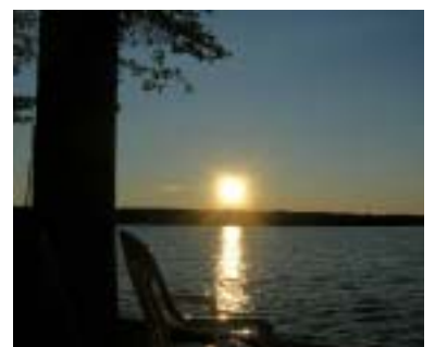
Shekhinah Seekers Retreat ~5~

“Community is not an end in itself. It is a way of being in solidarity with the work of the Holy Spirit.”