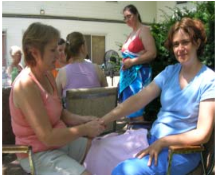
Women enjoying the luxury of a hand massage

On July 14 th a two-year dream became a reality. Seventeen women who live with the burden of poverty but volunteer their time and energy to the Hope Centre in Welland, and two Hope Center staff members were treated to a Women’s Wellness Weekend at Five Oaks. The bulk of the cost of the weekend was covered by the Niagara Presbytery Extension Council, Niagara UCW women and the Sisters of St. Joseph in London. In