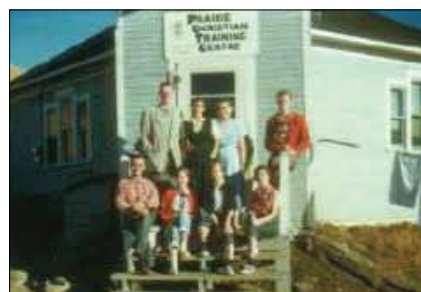
The first building and the first students.